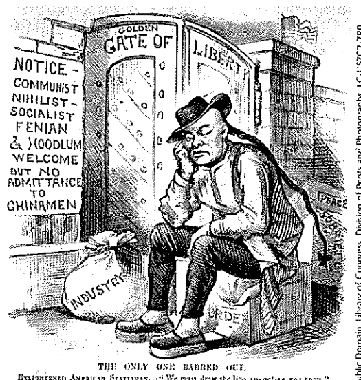
This cartoon is from 1882, the year that Congress passed the Chinese Exclusion Act.

The anti-immigration movement that emerged at the end of the nineteenth century drew upon the racist and intolerant ideas advocated by the Know-Nothings half a century earlier. Other groups also protested immigration. Labor union organizers, for example, feared that immigrants' willingness to work for low wages would hurt their struggle to increase